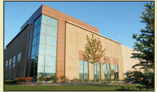
Examples of Class A Industrial Buildings in RidgeView Corporate Park