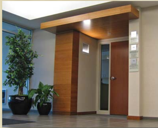
Typical Suite Entry